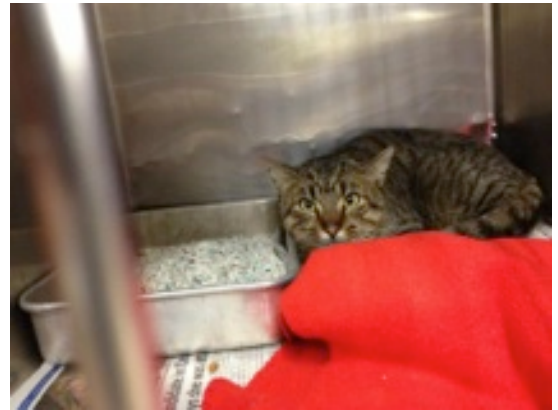
Ears are back, pupils large, tucked down, trying to hide.