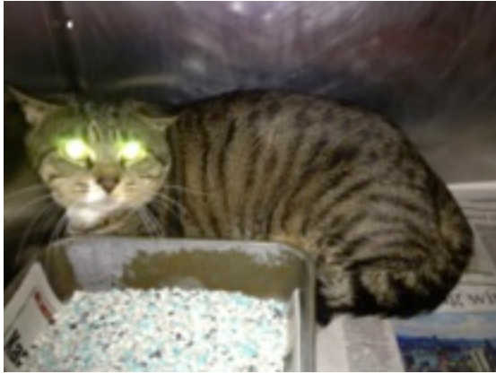
Ears are back, pupils large, tail tucked, trying to hide.