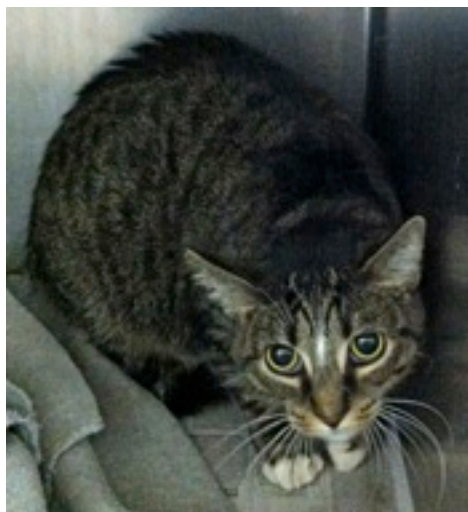
Smashed into the far back corner, balled up, pupils very large, hackles raised, very confused and frightened look.