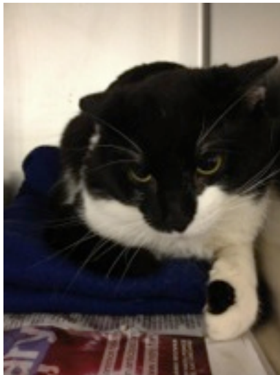
Ears back, large pupils, but front right foot is tucked underneath, he is sitting on his bed and somewhat forward in his cage. Evaluate further: very possibly just scared/angry but friendly.