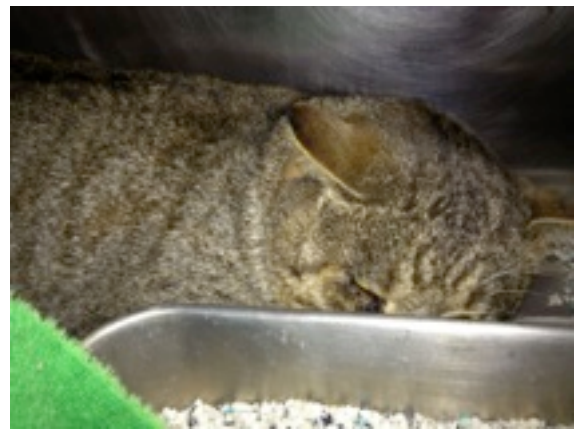
Head buried, ears flat, refusal to make eye contact. No interest in his bedding, just wants to be invisible.