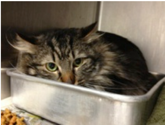
Very alert, threatened appearance. His eyes say he is very concerned about the cameraman.

Here are photos of impounded cats taken at the animal control we work with most frequently. Each of these cats was considered for barn cat placement. Please note that appearance is only one factor in determining temperament, each cat should still be assessed by trying to interact with her and giving her time to relax.