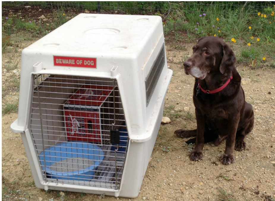
A relocation crate and an adult male chocolate lab to show scale.

No matter what crate you use, it should be large enough to humanely house two adult cats. A 42" or larger Midwest crate does nicely.