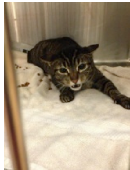
Ears flat against head, huge pupils, sunk down against the floor, defensive posturing. Food spilled due to thrashing in cage.